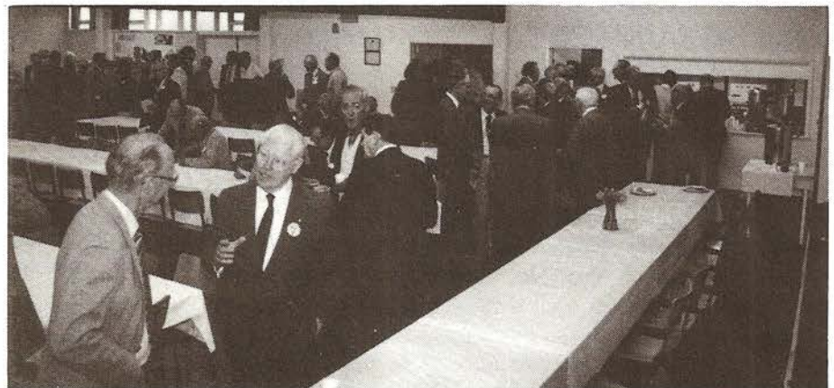
1987 ROUND UP BRECHIN UNITED CHURCH